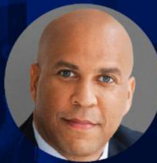
Cory Booker U.S. Senator (D-NJ)

U.S. Capitol Visitor Center First Street NE Senate Room 209-08 Washington, DC 20515 9:00 am - 6:30 pm