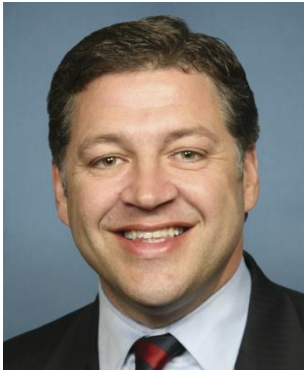
House Transportation & Infrastructure Chairman Bill Shuster (R-PA)