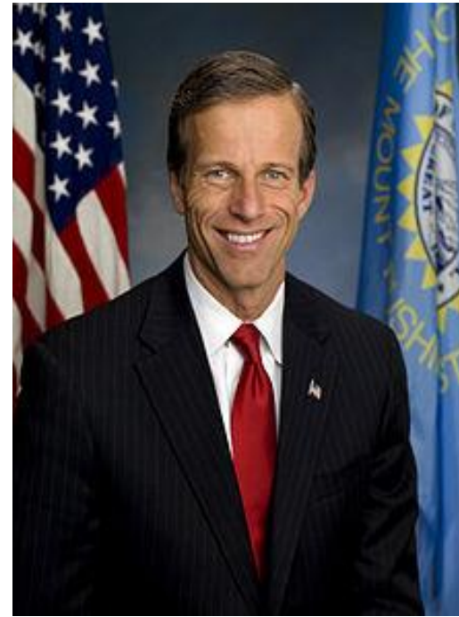
Senate Commerce Ranking Member John Thune (R-SD)