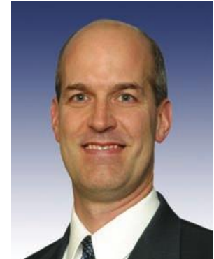
House Aviation Subcommittee Ranking Member Rick Larsen (D-WA)