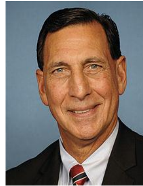
House Aviation Subcommittee Chairman Frank LoBiondo (R-NJ)