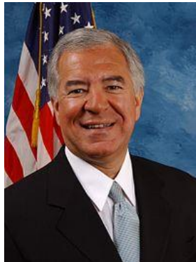
House Transportation & Infrastructure Ranking Member Nick Rahall (D-WV)